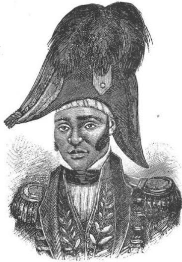
GENERAL JEAN JACQUES DESSALINES, LIBERATOR OF HAITI.

Derived from the fact that Haiti, after two hundred years, a nation that should be the light and salt of the earth, represents for some foreign detractors a "basket case" and for others a "shitty land". Without accepting the characterization of its detractors, we Haitians have betrayed the mission and the wishes of our founder Jean Jacques Dessalines who left us this message: